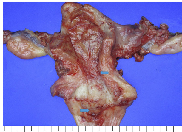
Figure 2. The gross findings of a radical hysterectomy specimen revealed an ill-defined and protruding mass (5.7 cm × 2.7 cm × 2 cm) of the uterine cervix, which superficially extended to lower portion of the endometrium, and the upper vagina (arrows)

cytoplasm, see Figure 3B). There were multiple foci with tongue-like projections below the basement membrane (see Figure 3C). The endometrium was involved with condylomatous squamous nests along endometrial glands (see Figure 3D). The Ki-67 labeling index was approximately 20% in the hot spot (see Figure 3E). Immunohistochemical staining yielded negative results for p16 expression (see Figure 3F). The results of the HPV DNA chip test extracted from paraffin embedded tissue were 6 (low risk, +++) and 42 (low risk, +). She was well without evidence of disease three months post-operatively.